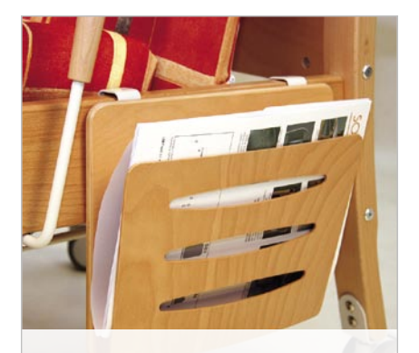
Holder for newspapers and magazines