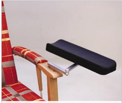
Flexible hand support