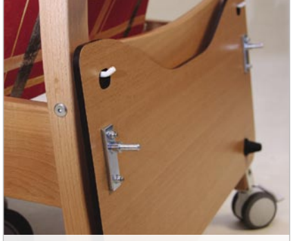
Hook on the back part of the construction for fixation and storage of the eating desk