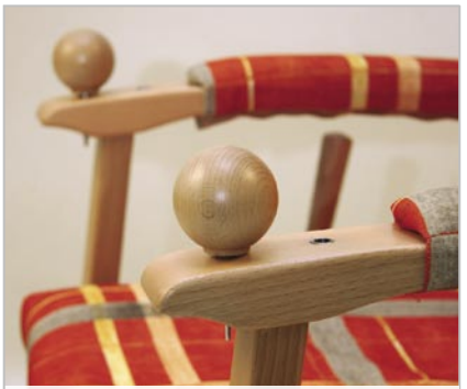
Comfortable and practical removable covers of the armsrest