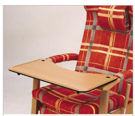
Removable ergonomic eating plate with enhanced edges