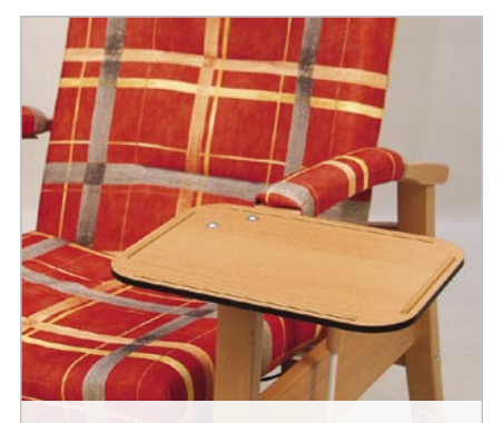
Revolving shelf with enhanced edges