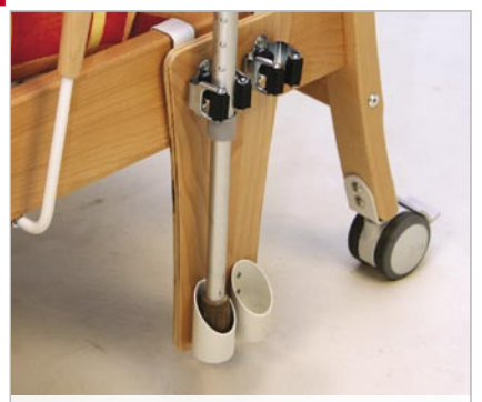
Crutches holder with a holder for easy clamping