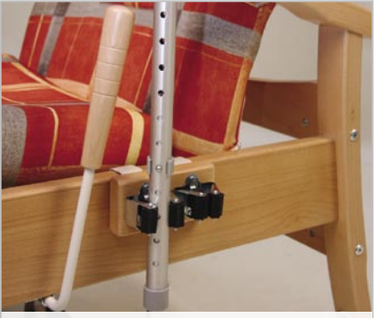
Crutches holder for practical placement of crutches while sitting