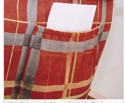
Hand approachable pocket in the back part of the backrest