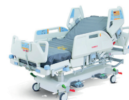
Multicare, Multicare LE